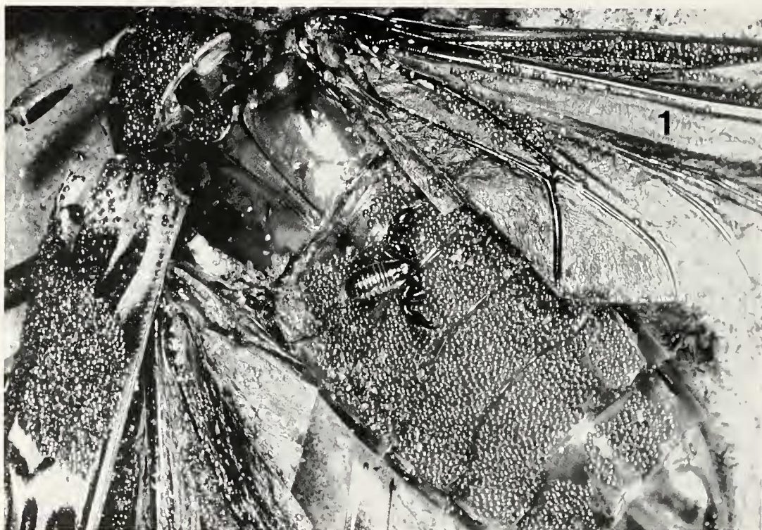
Figure 1.—Harlequin beetle with elytra opened to display female Cordylochernes scorpioides and unusually heavy infestation of mites.

never found individuals of these species under the elytra of harlequin beetles ( N = 149 beetles).